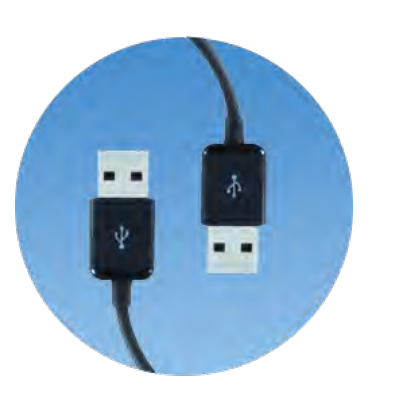
Cascading Easily cascade (daisy chain) multiple PDUs in a rack. Save money on IP drops, Ethernet ports, and patch ports.

While few vendors offer USB ports on their PDUs, or only offer firmware upgrade capabilities, Raritan USB ports can lower your capital expenditures, improve your power management capabilities, and give you greater control over your IT equipment racks! Our full-featured racks provide the following capabilities: