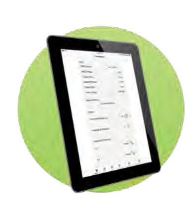
PDView App Turn your tablet or phone into a remote display. Raritan's PDView app provides at-the-rack display of all critical data.