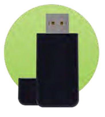
Quick Setup Use ordinary USB sticks to configure hundreds of PDUs in mere minutes. Save big on deployment time and costs.