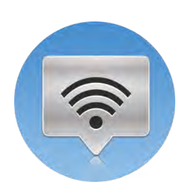
WiFi Run out of network drops? No problem. With USB WiFi, Raritan iPDUs can be networked without additional expense.